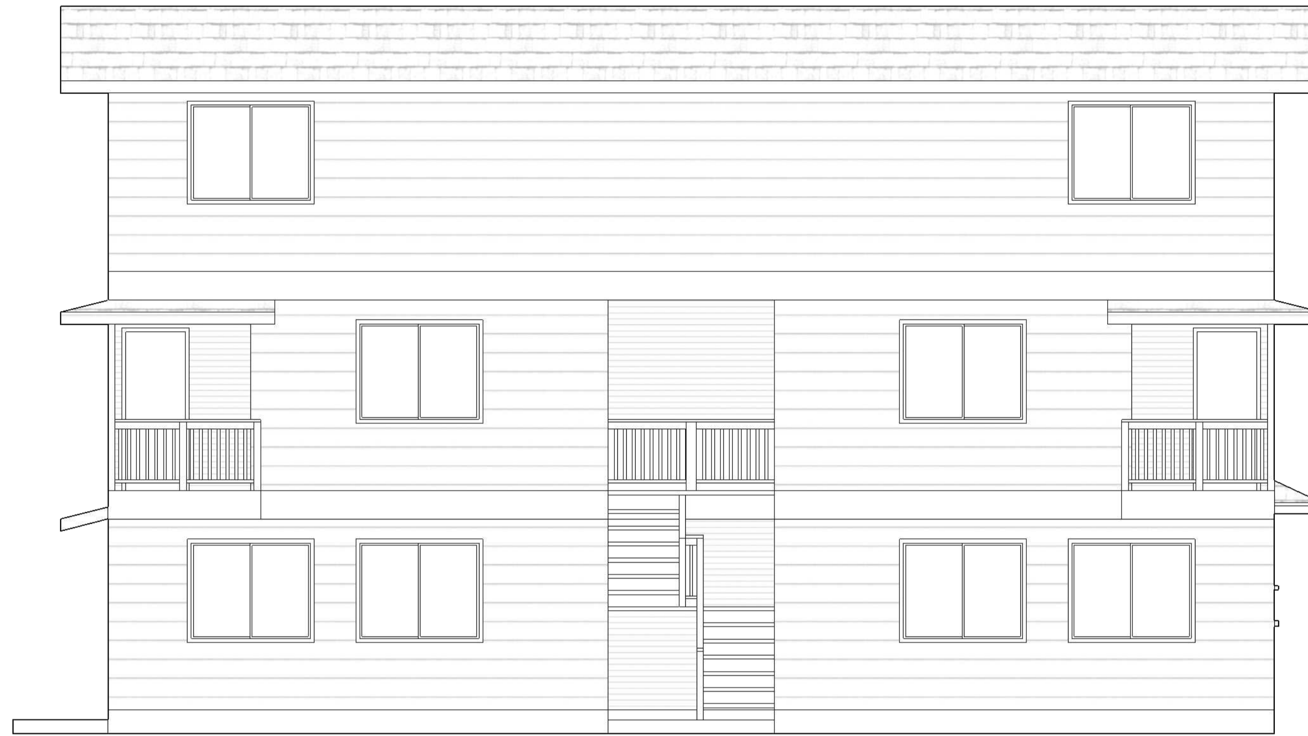
Northeast Elevation 1/4" = 1'