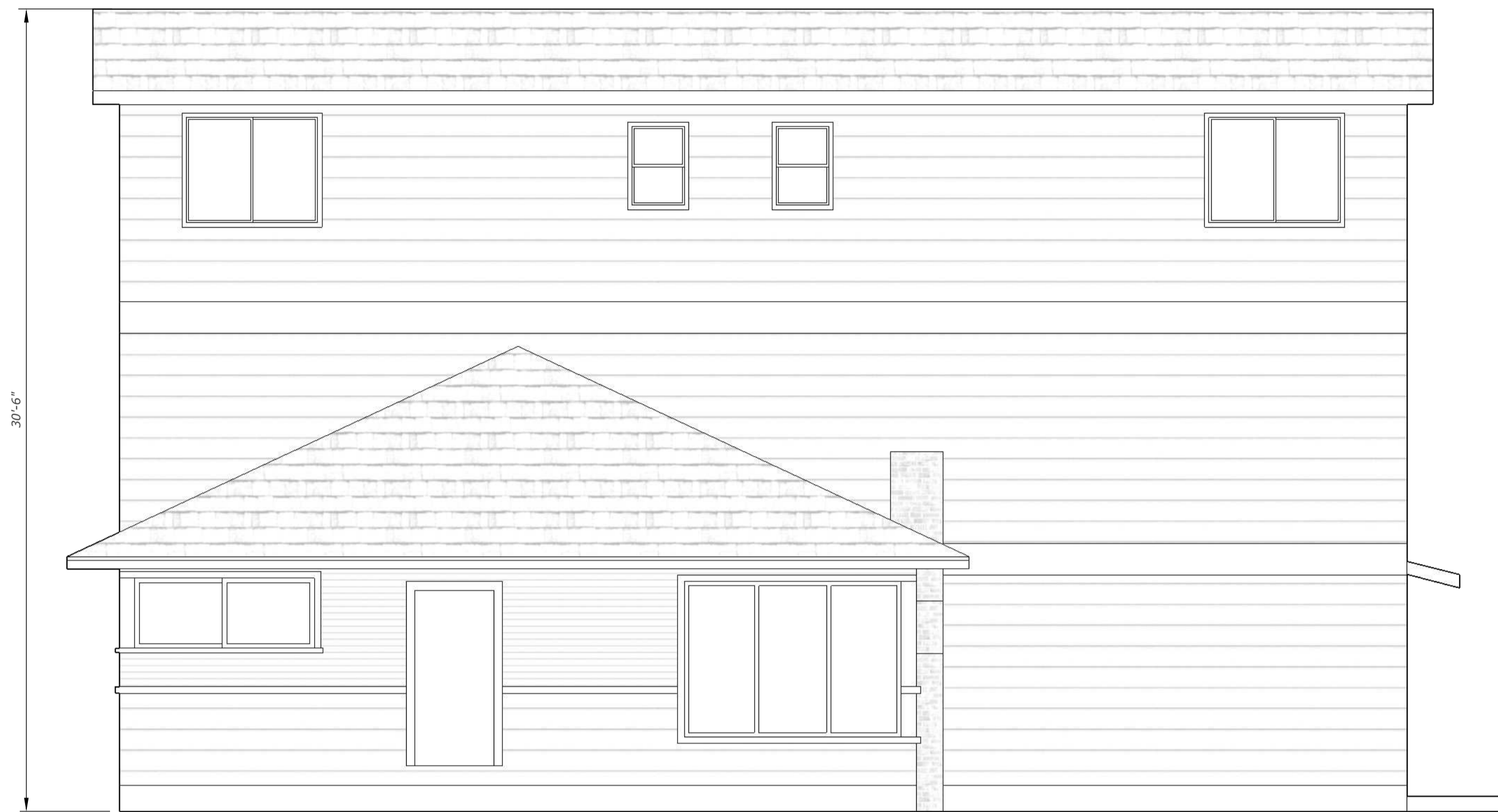
Southwest Elevation 1/4" = 1'