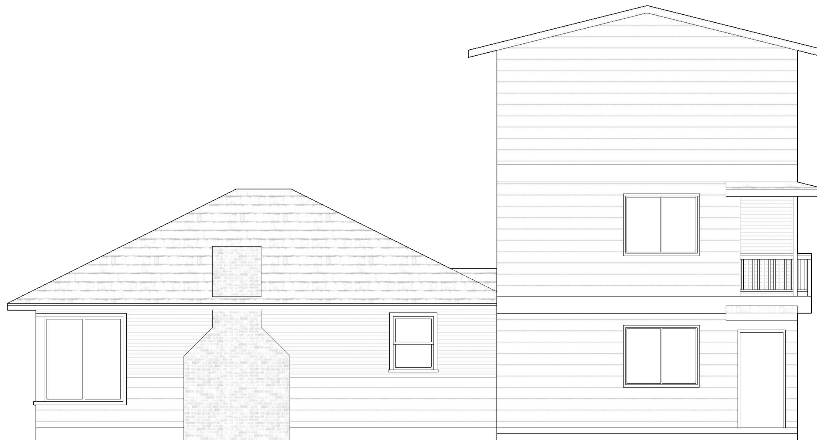
Southeast Elevation 1/4" = 1'