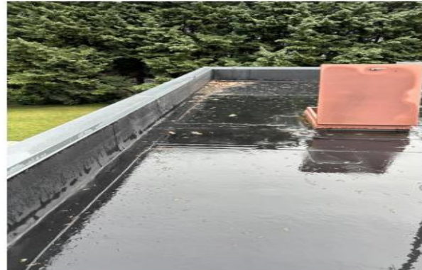
Fig. 2 Office Building