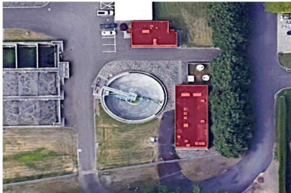
Figure 1: Aerial View of Office and UV Building

SUMMARY: The City utilized the OMNIA CO-op purchasing agreement to contract with Garland/DBS, Inc. who will provide contract oversight on the project construction.