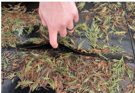
Figure 3: Fish Mouth along seams of membrane welds