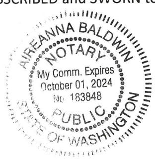
Page 1 – Affidavit of Mailing