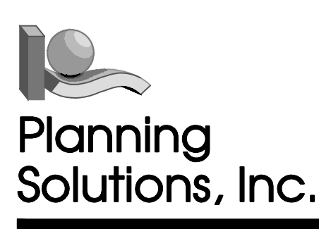
Exhibit 23 SUB22-05