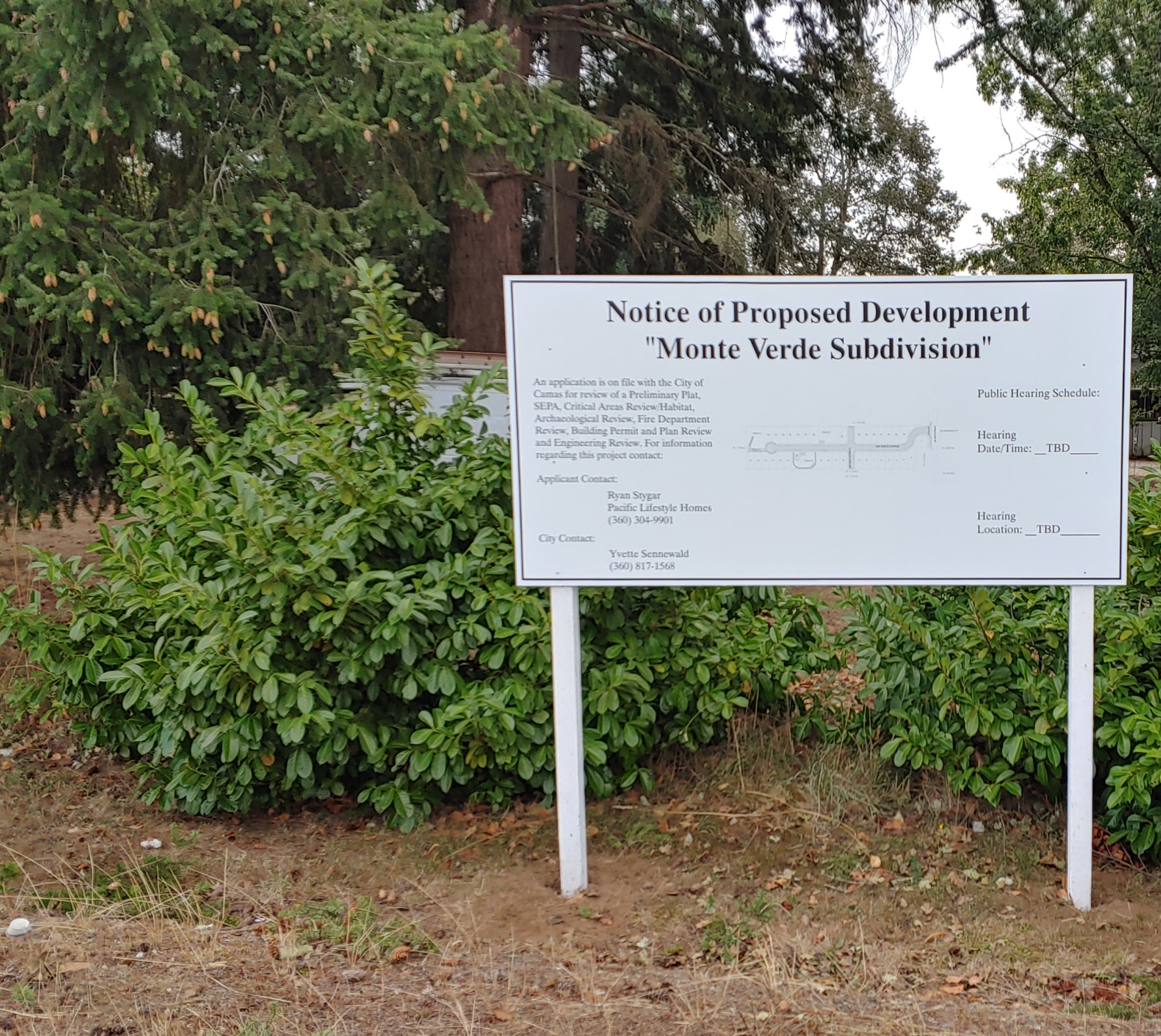
Exhibit 13 SUB22-05