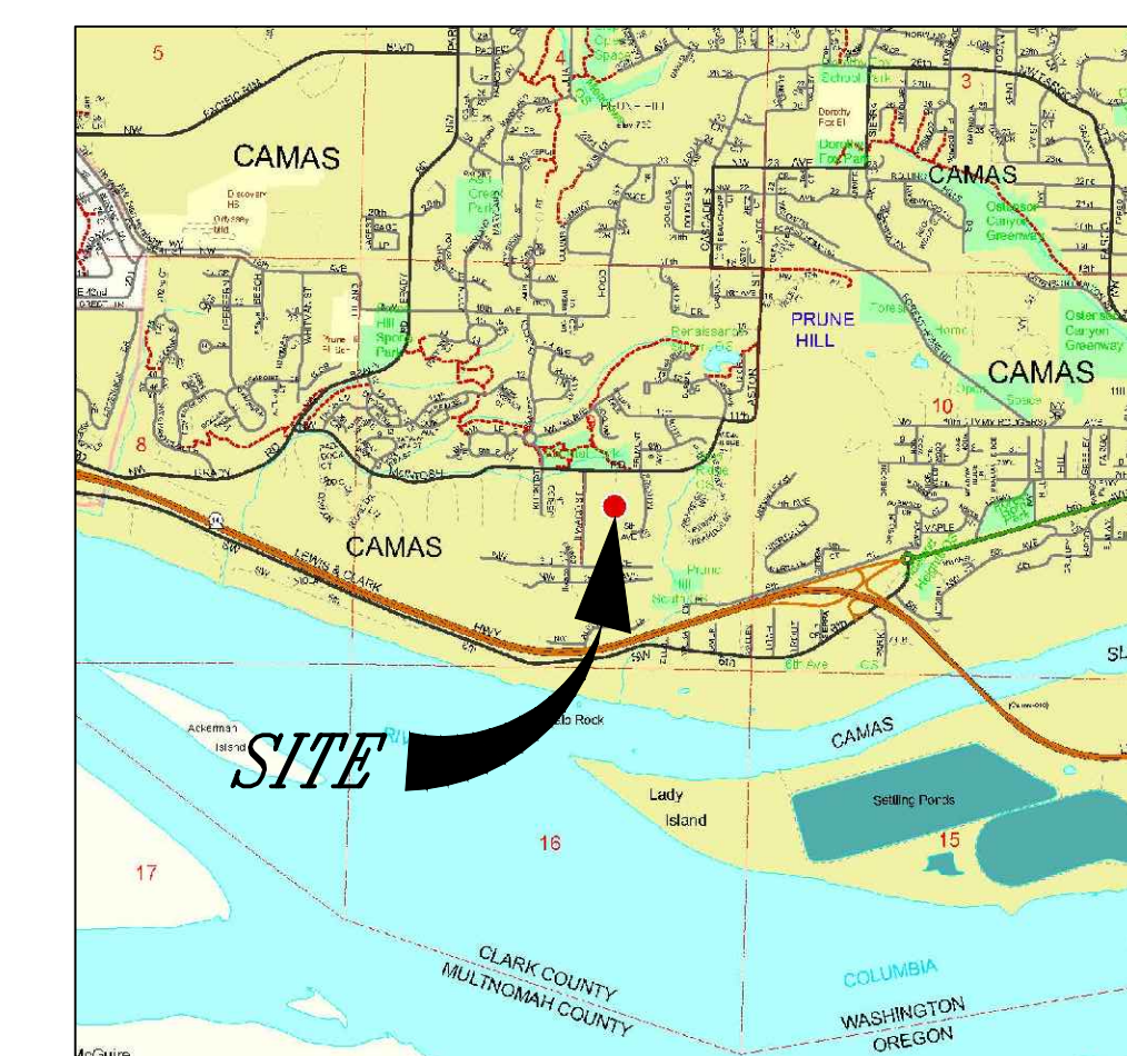
VICINITY MAP SCALE: NTS