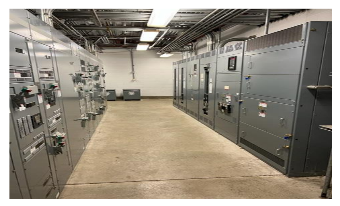
Figure 2 Electrical Room