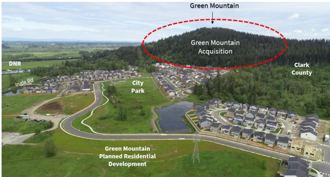
Figure 1: View of Green Mountain property from the south.