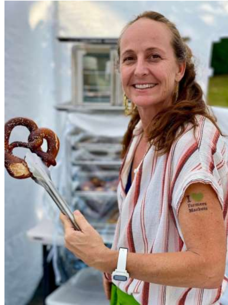
XYZ BAKED GOODS