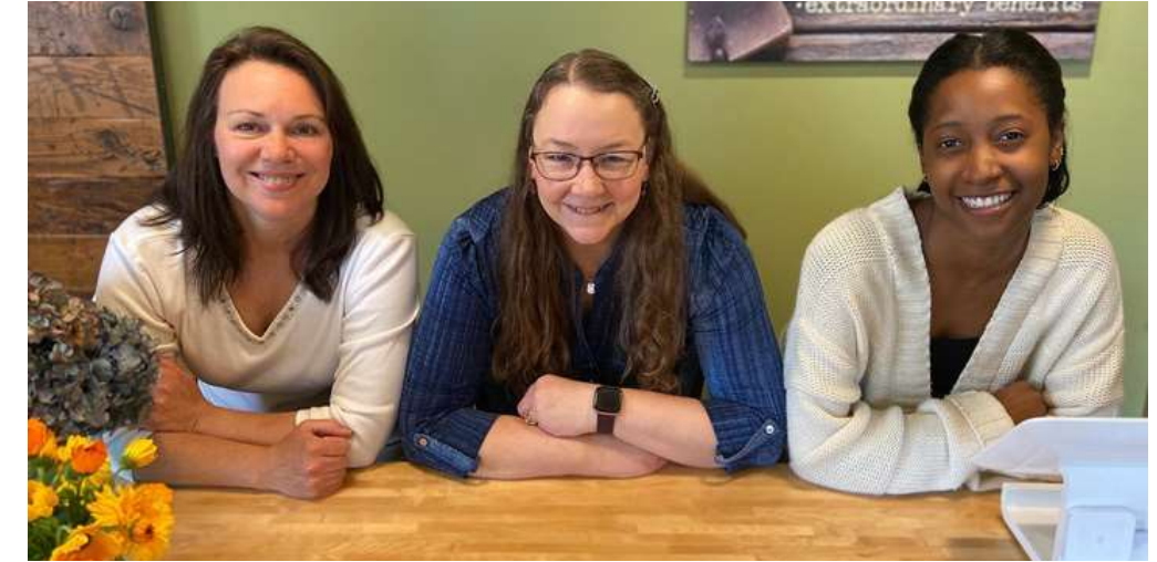
THE SOAP CHEST

Other Camas businesses that grew with the Camas Farmer's Market include: