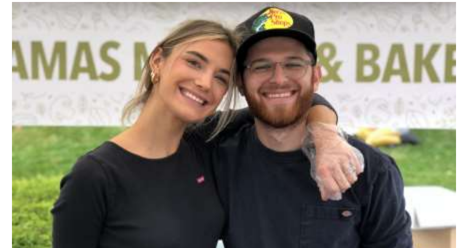
CAMAS MARKET & BAKERY