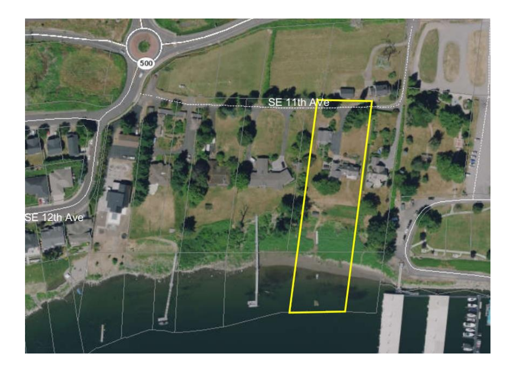
Nevin's Dock Site Plan