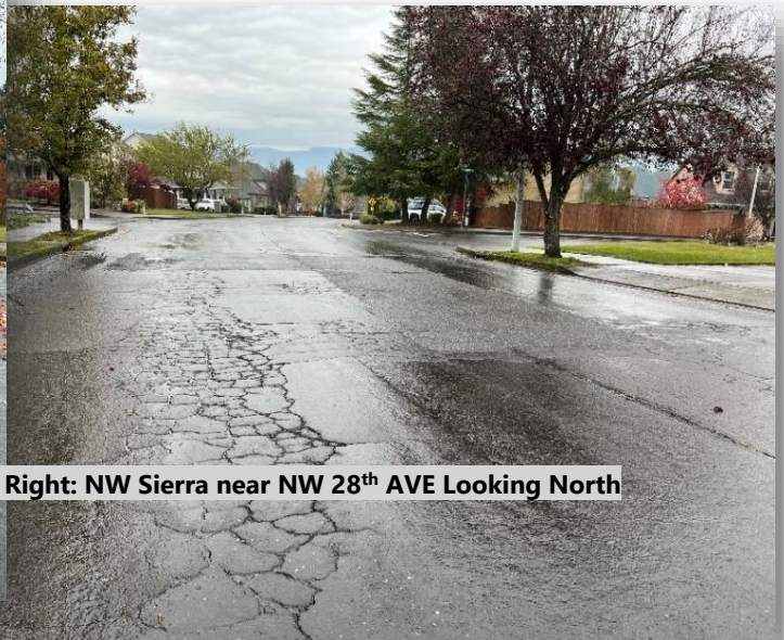
Right: NW Sierra near NW 28 th AVE Looking North