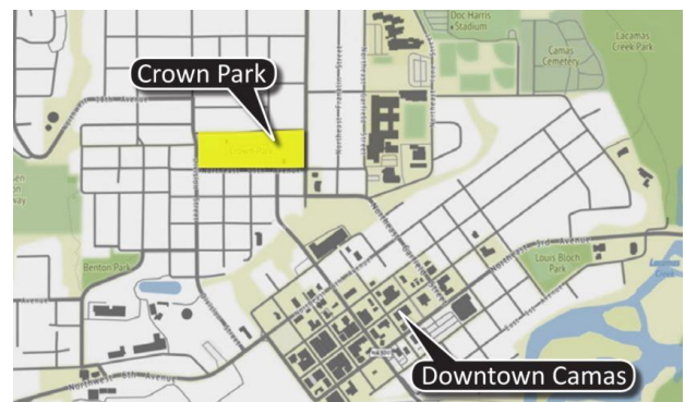
Figure 1: Park location map