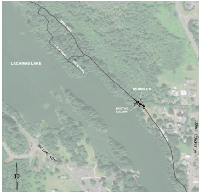
Figure 2 – Proposed T-3 (aka. East Lake Trail) trail alignment

SUMMARY: As noted, preliminary design had been completed in 2017 and 2018, which included natural resource fieldwork and evaluation, stormwater analysis, land surveying, preliminary trail design and alignment, and permitting (including Joint Aquatic Resources, Clean Water Act, Endangered Species Act, and SEPA). Due to the pandemic, the project was then placed on hold until now.