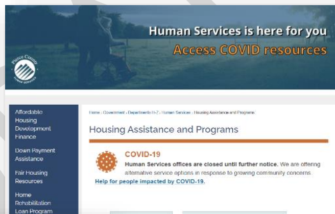
Housing Websites from Tigard, Oregon; Pierce County, Washington; and Redmond, Washington

To communicate that housing affordability is important to the City of Camas and to inform residents and housing professionals about the availability of housing resources, Camas should develop a page on the City's website dedicated to housing. This page could share information about the current supply of affordable housing in the city, including Camas Ridge and Crown Villa Apartments, with links to the Vancouver Housing Authority. It could also provide information about first time homebuyer assistance available through the Washington State Housing Finance Commission's down payment assistance program, Proud Ground (when assistance is available in Clark County), and others. Camas could also consider hosting a home buyer education event through the Washington State Housing Finance Commission or other partner and advertising it on this page.