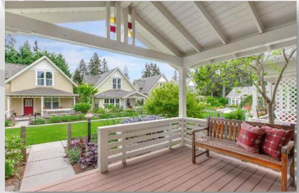
Cottage Clusters in Shoreline (L) and Kirkland, WA (R)