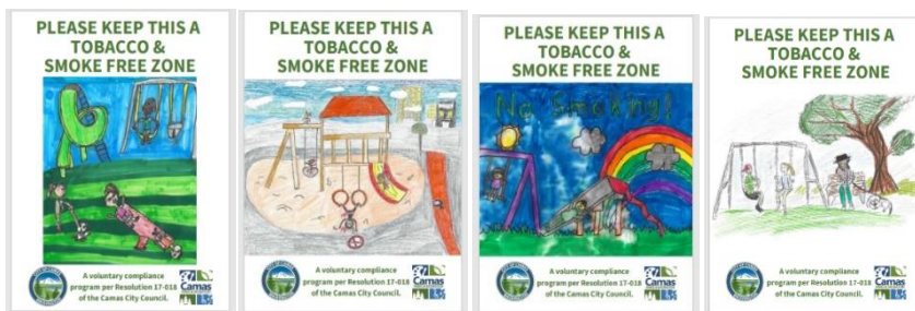
No Smoking signs with student art