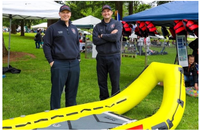
C-W Fire Dept. at CamTown's water safety booth