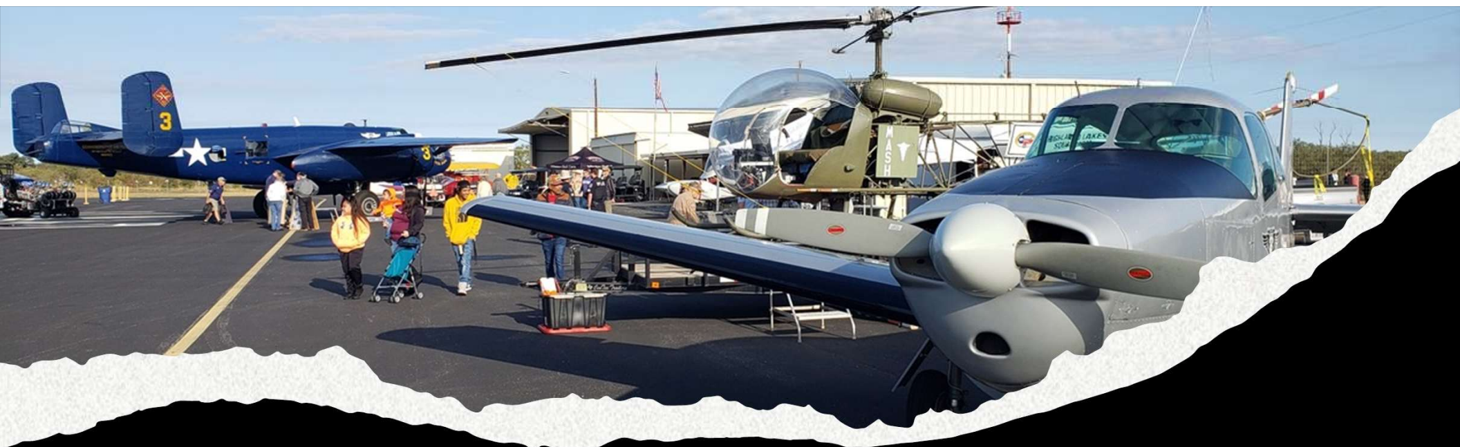
Llano's Wine, Wings and Wheels Airshow, 9 Nov 2024