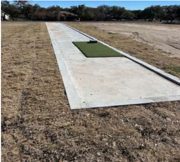
DIRT WORK AND NEW CONCRETE