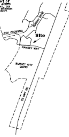
SITE MAP Scale: 1"=2000'

SHEET 1 OF 2 Scale: 1"=100' Date: 04/24/24 Reid Book: Deb. Drawn by: SJP File Name: 24-019.plt Approved by: S.W. Project No.: 24-019