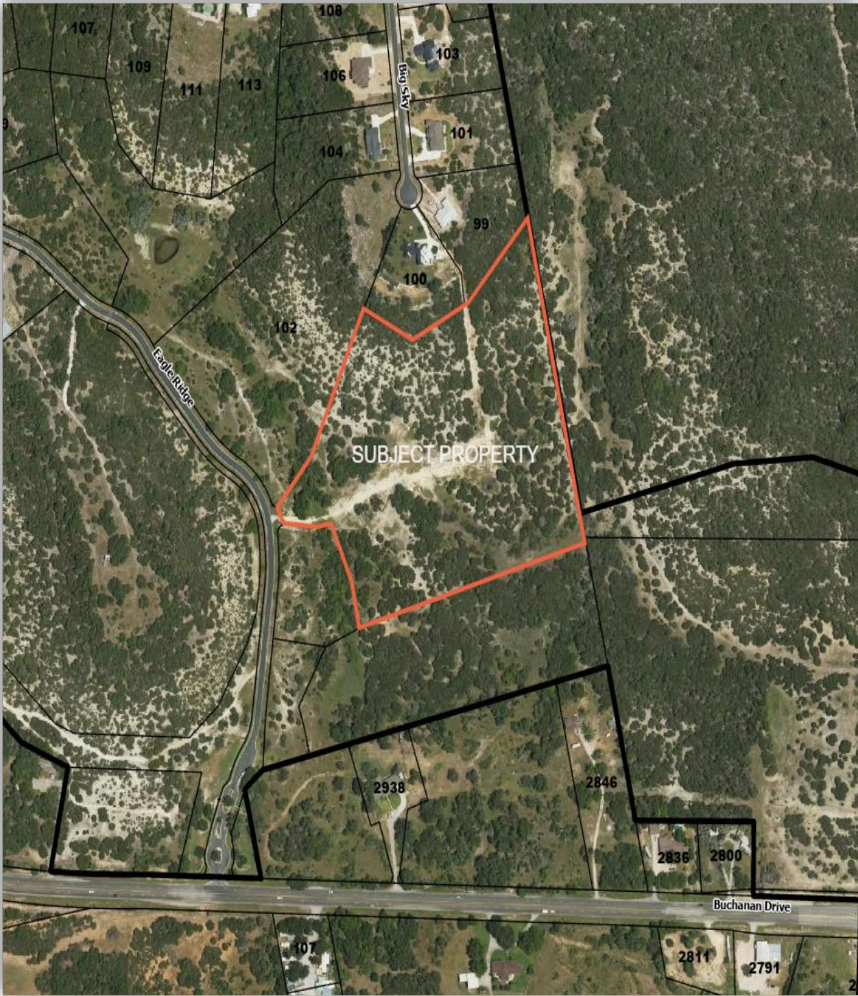
Exhibit A – Location