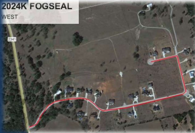
2024K FOGSEAL WEST