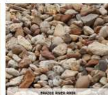
Brazos River Rocks