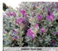
Dwarf Texas Sage