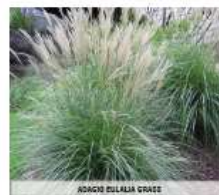
Adagio Callala Grass