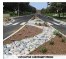
Undulating Hardscape Design