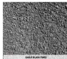
Dark Blue Pines