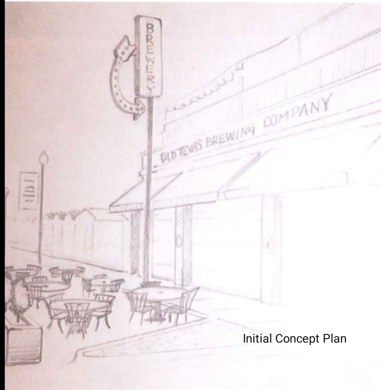
Initial Concept Plan