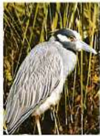
Yellow-Crowned Night Heron