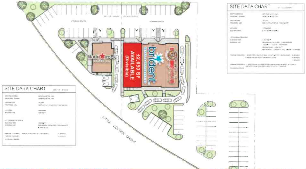
Exhibit B Concept Plan