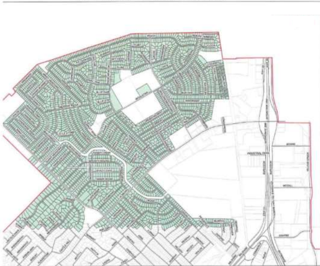
Burleson Parcels with Homes in Tarrant Co.