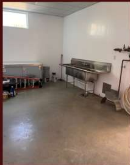
DOG PREP ROOM