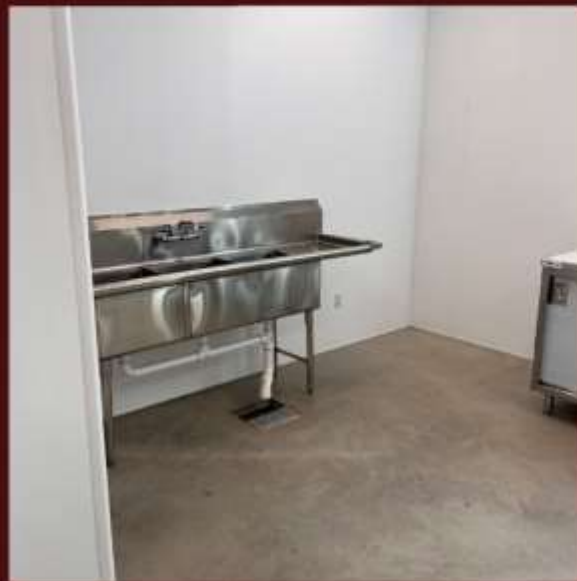
CAT ROOM SINKS