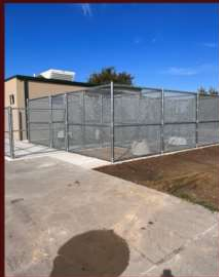
OUTSIDE DAY PLAY YARD