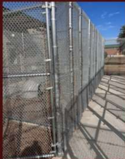
OUTSIDE DAY PLAY YARD