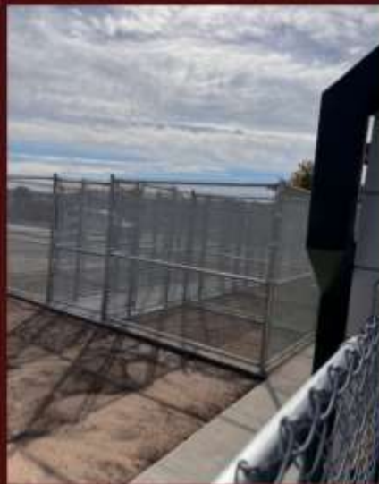
OUTSIDE DAY PLAY YARD