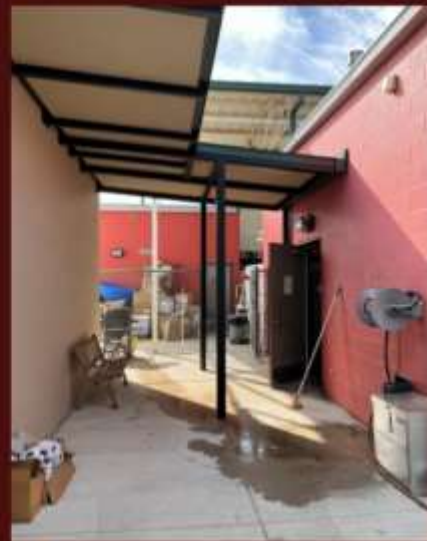
BREEZEWAY BETWEEN BUILDINGS