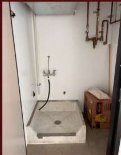
MOP / UTILITY ROOM