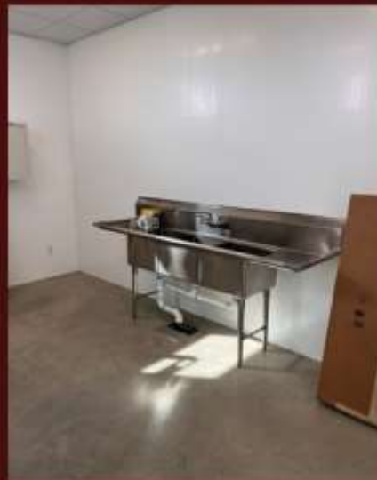
EXAM ROOM SINKS