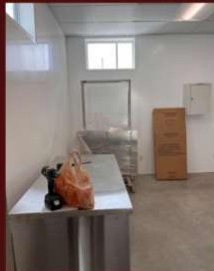
EXAM ROOM TABLE /DRUG BOX