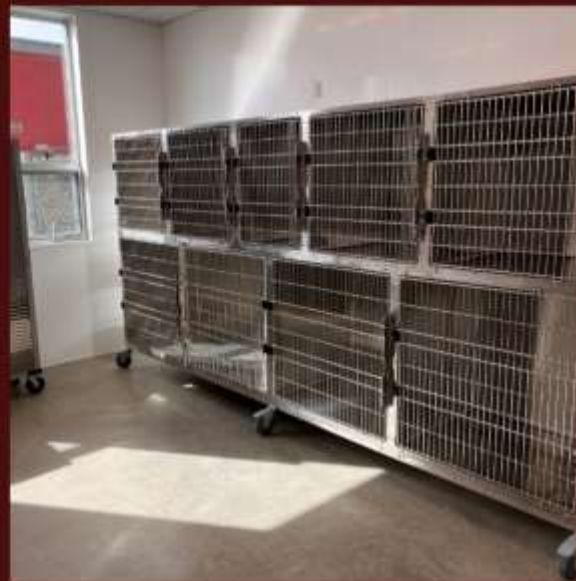
CAT ROOM CAGE BANK