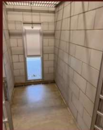
INSIDE / OUTSIDE DOG DOOR