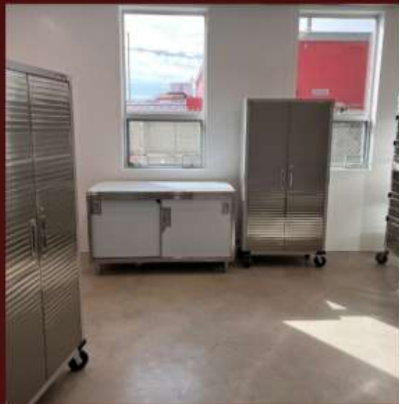
CAT ROOM WINDOWS