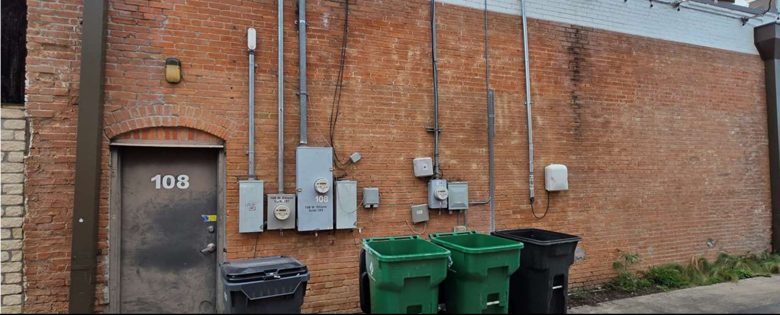
The Groovy Yoga Studio located at 108 W Ellison Street