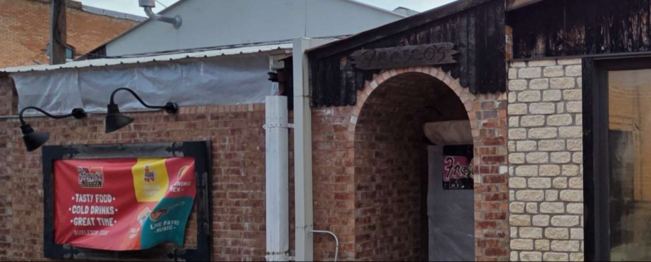
Fresco's Cocina Mexicana located at 112 S Main Street