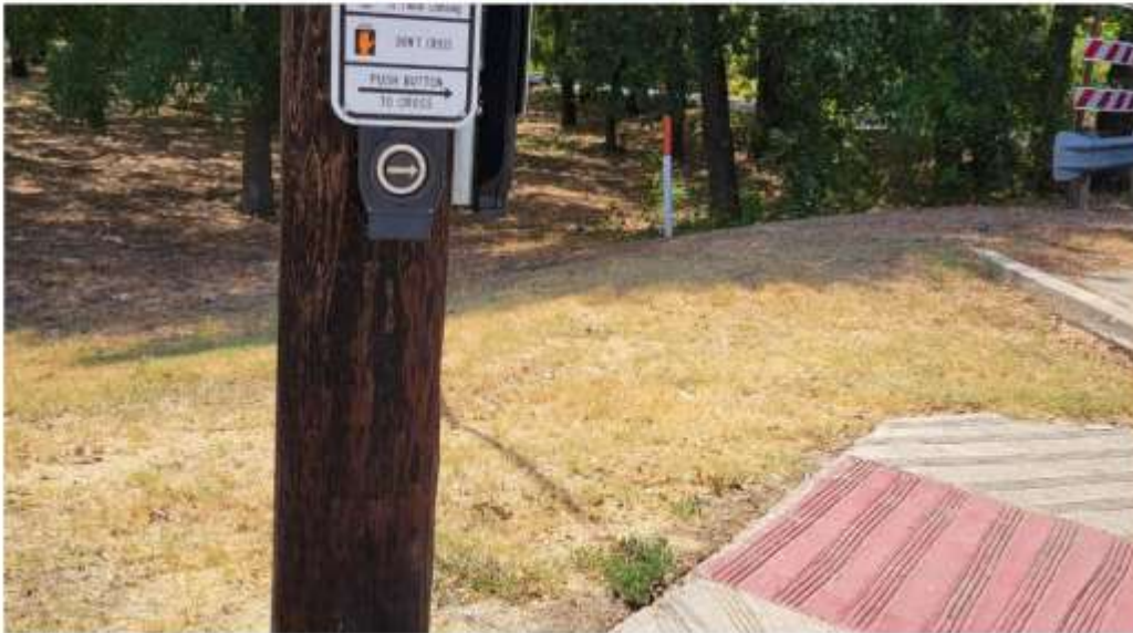
Crosswalk connecting Oak Valley Estates to Oak Valley Trail