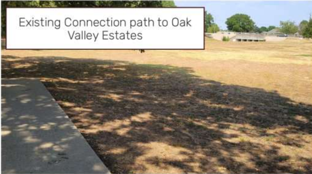
Existing Connection path to Oak Valley Estates