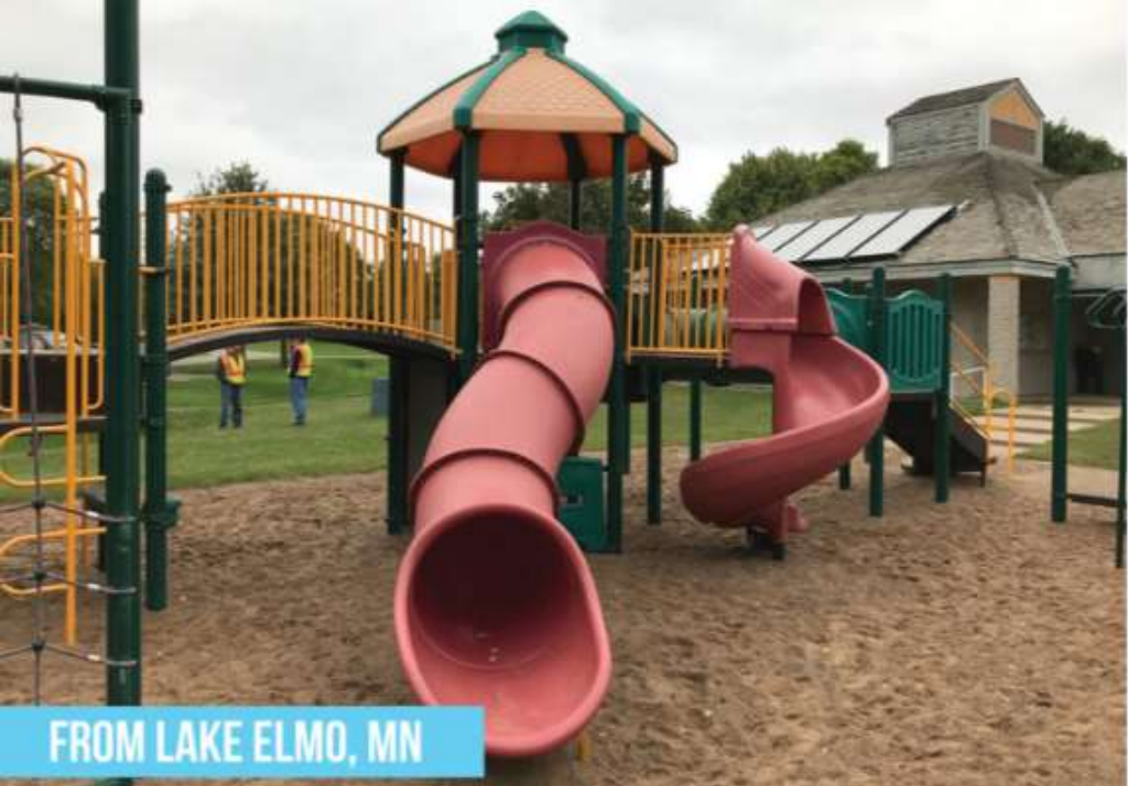
FROM LAKE ELMO, MN