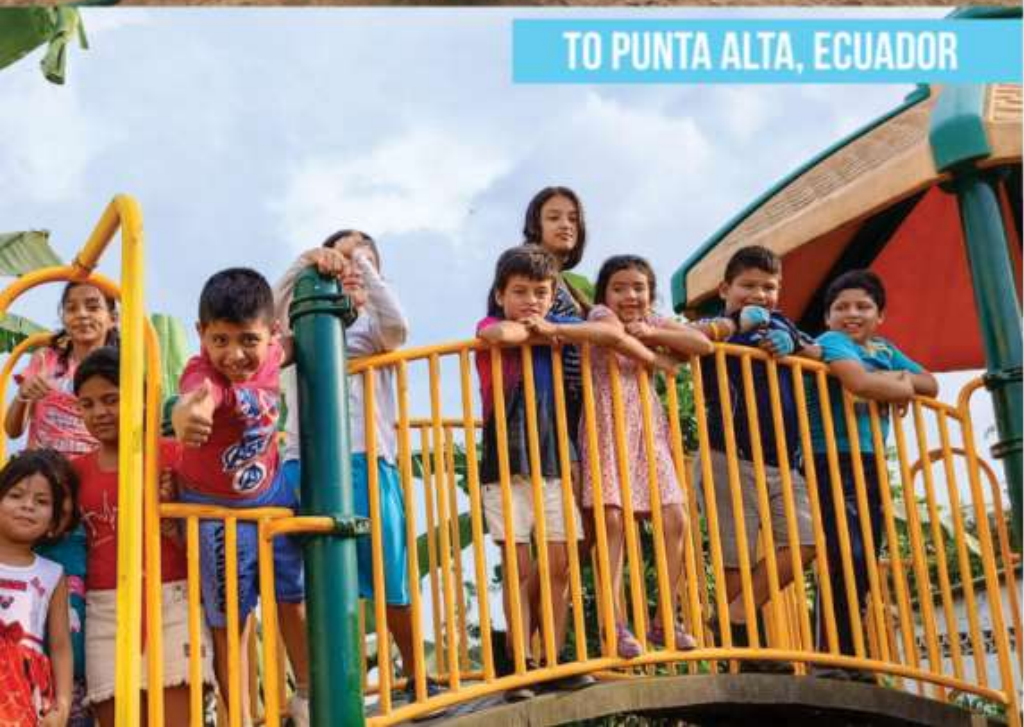
TO PUNTA ALTA, ECUADOR