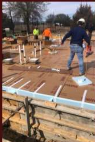
FOUNDATION CARDBOARD VOID FORMS