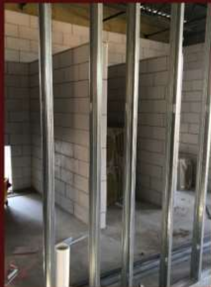
PLUMBING IN WALLS