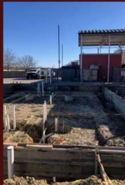
ROOM STRING LINES