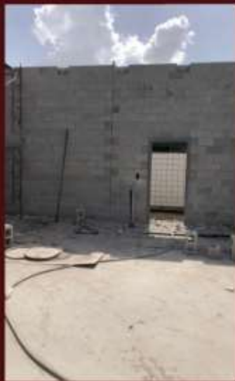
CMU BLOCK GOING UP