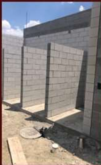
KENNELS BEING BUILT