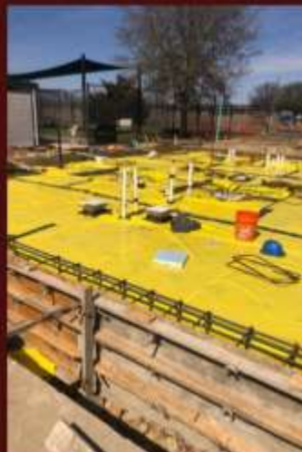
FOUNDATION REBAR AND SLIP PLASTIC SHEETING