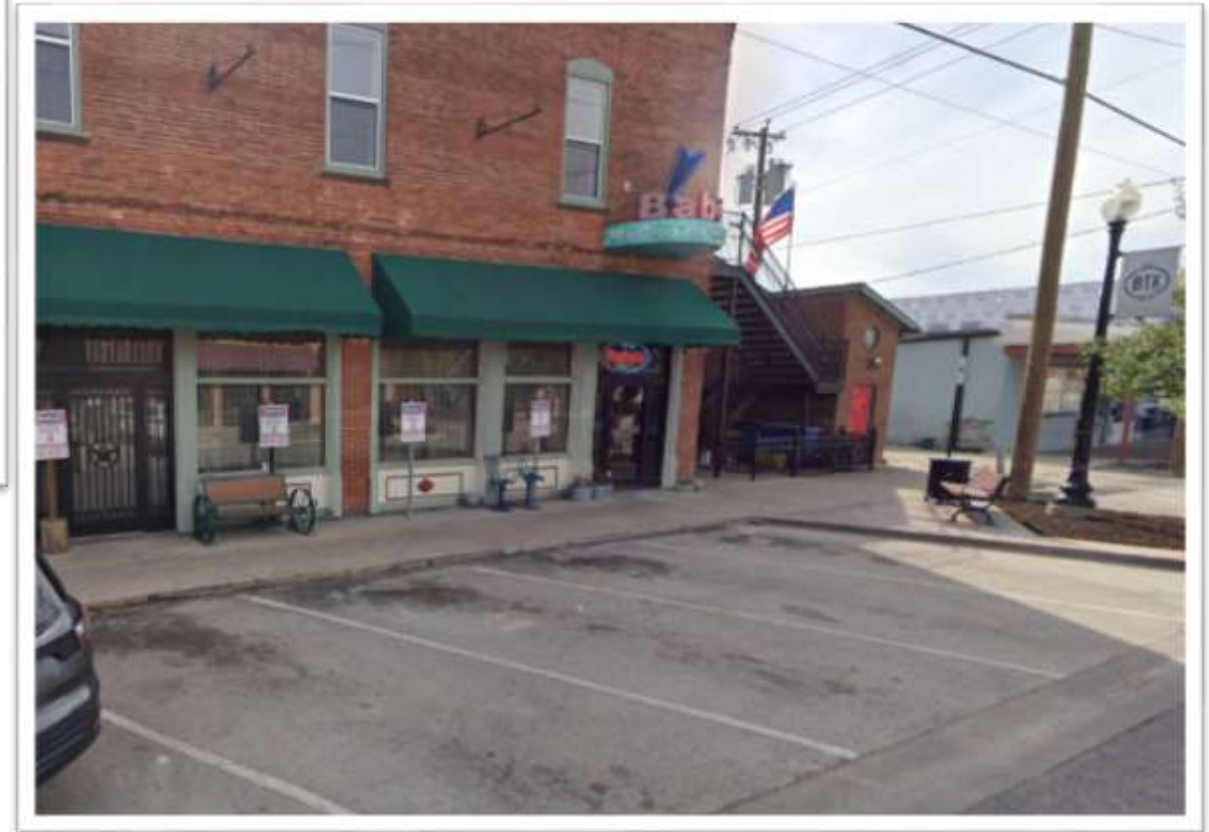
Curbside To Go Parking at Babe's (by agreement)