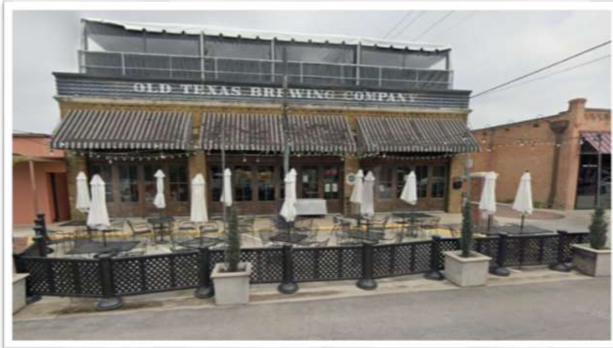
Outdoor Seating (by agreement)