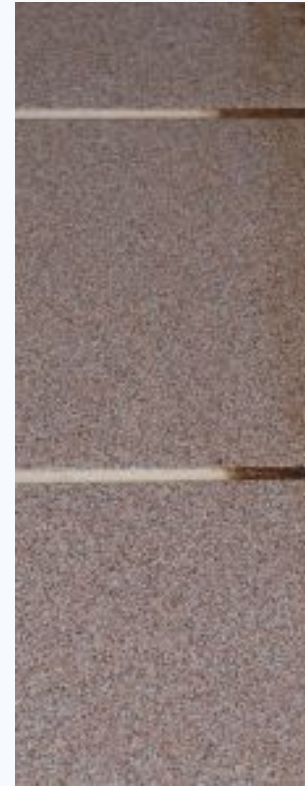
Tile & Grout