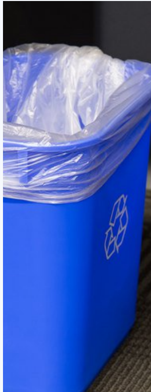
Garbage & Recycling