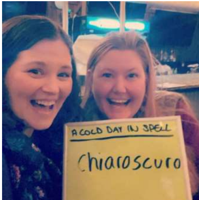
Adult Spelling Bee Attendance: 47