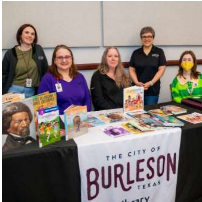
Celebrate Black History Month with Opal Lee