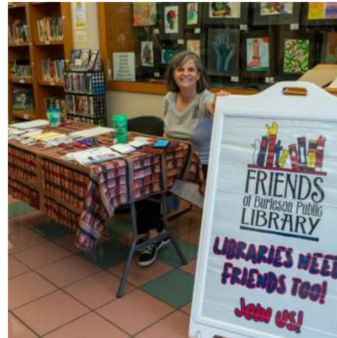
The Great Giveback (connecting citizens with nonprofit organizations) Attendance: 378