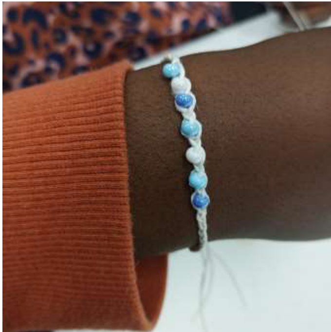
Teen Wish Bracelet Attendance: 23