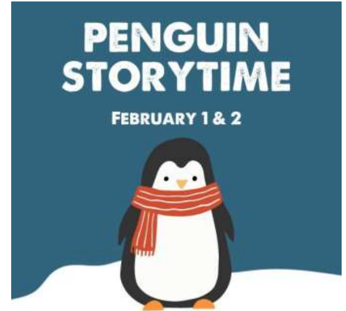
Storytime (Average Attendance) Baby: 41 Toddler: 67 Preschool: 51