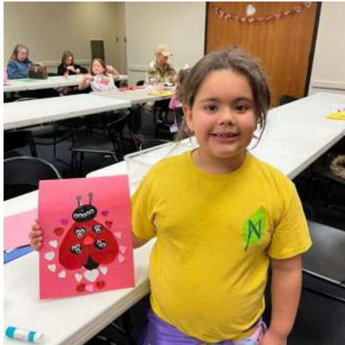
Valentine's Day Crafts Participants: 106