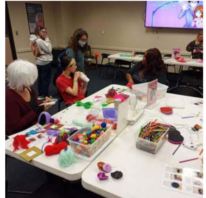
Teen Valentine's Crafts Attendance: 14