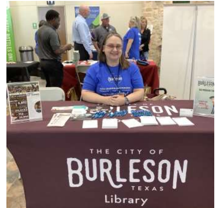
Burleson Business Showcase (with Burleson Chamber of Commerce)