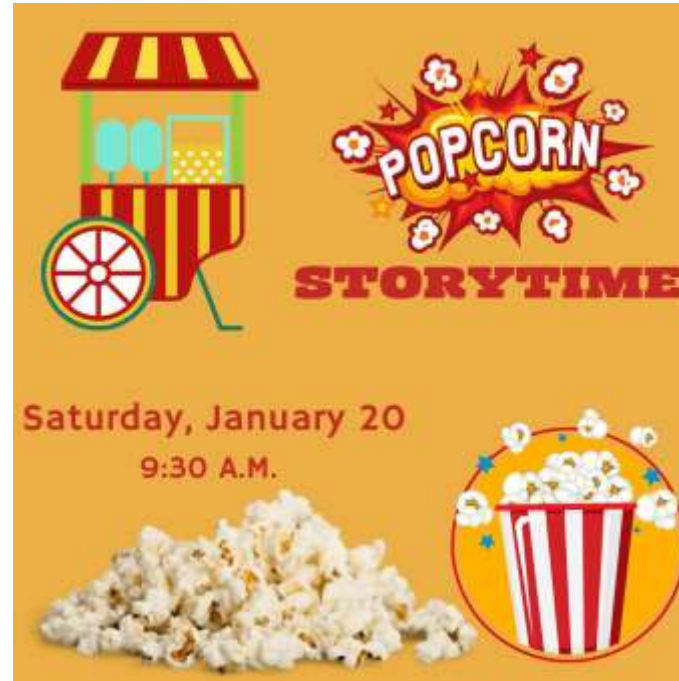
Popcorn Storytime Attendance: 36