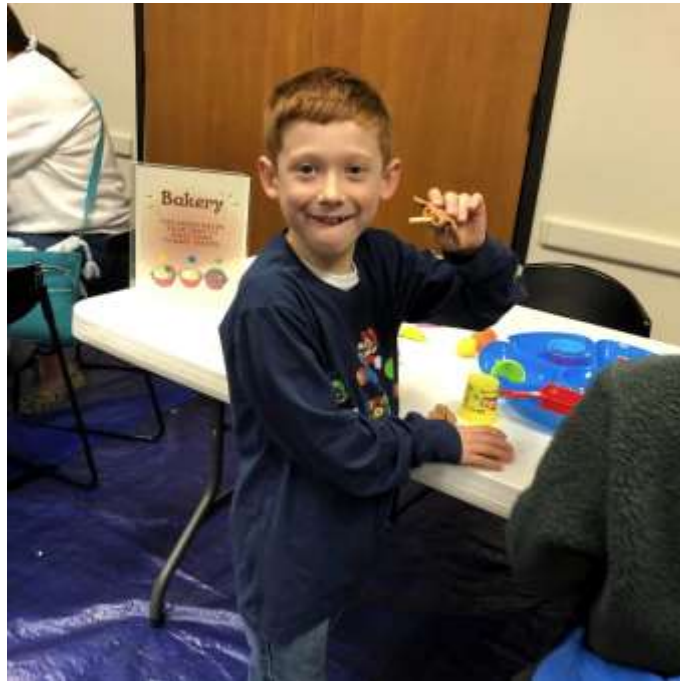
Play-Doh Playdate Participants: 90