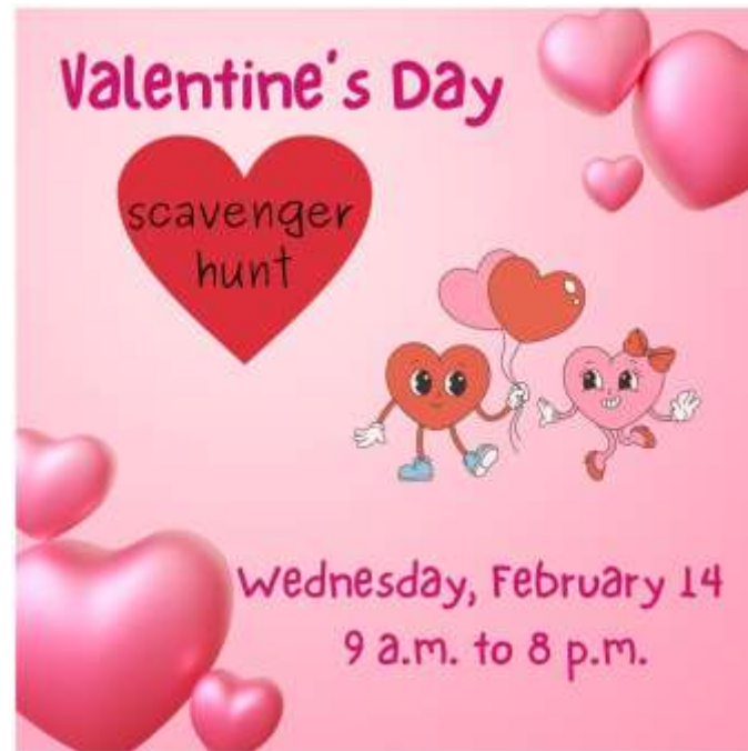
Valentine's Day Scavenger Hunt Attendance: 23