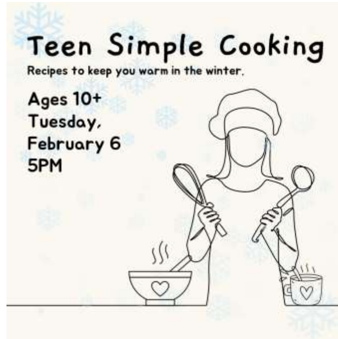
Teen Simple Cooking Attendance: 31