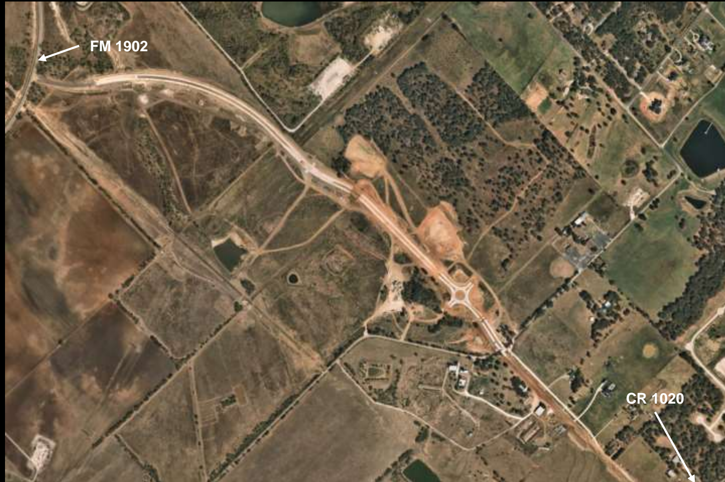
Lakewood – currently under construction

10-foot shared path within parkway on both sides