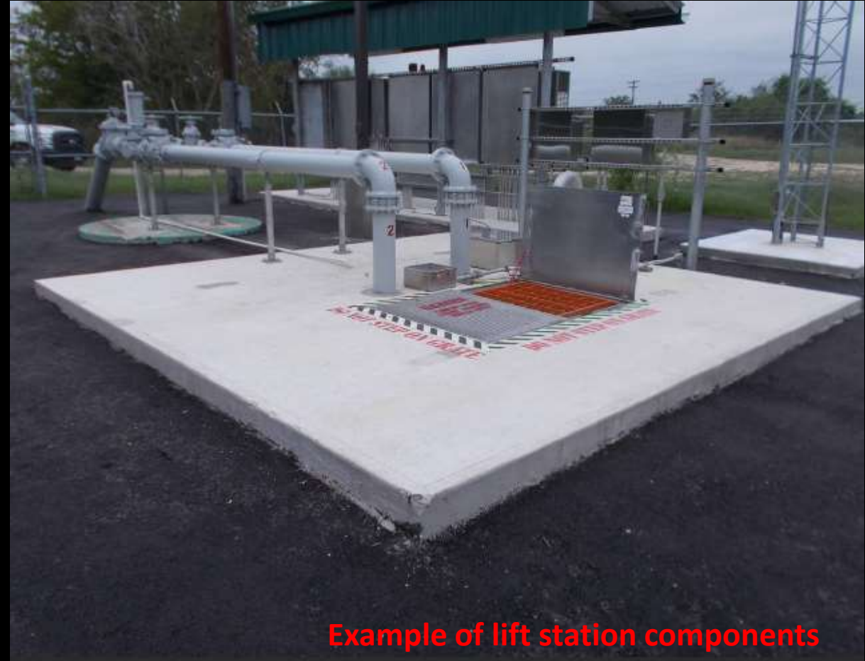
Example of lift station components

The evaluation team can elect to hold interviews for further evaluation of any offeror if deemed necessary