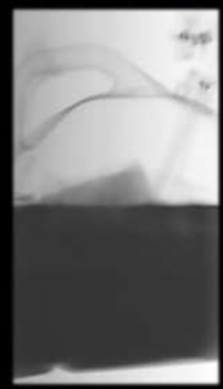
GAS CONTAINER DRUGS (FLOATERS)