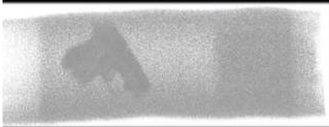
THICK STEEL PIPE GUN & DRUGS