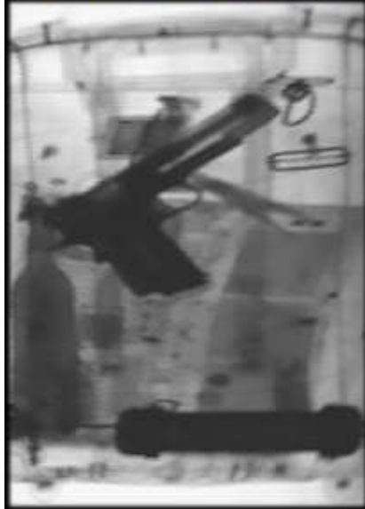
LUGGAGE GUN & PIPE BOMB