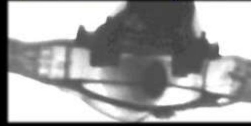
DIFFERENTIAL (HOLLOWED OUT) DRUGS