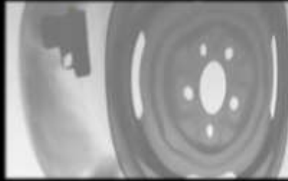
TIRE GUN & DRUGS