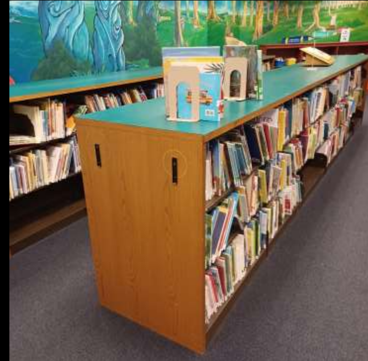
Existing picture book shelving from 1996