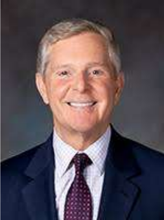
Sen. Phil King - R