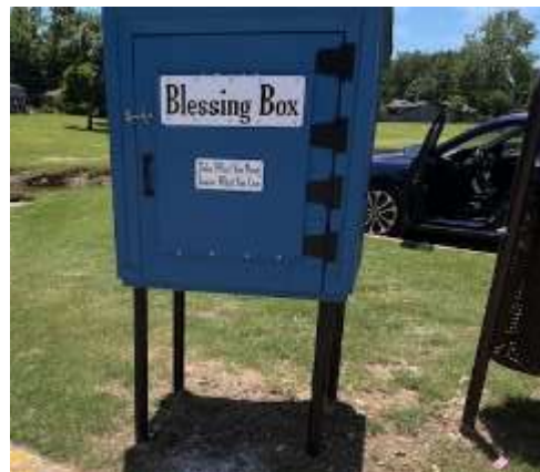
Warren Park 301 SW Johnson