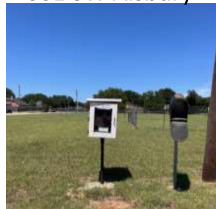
Impact Life Church 601 SW Alsbury