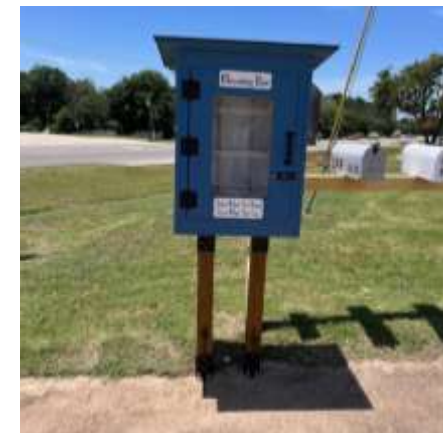
Renfro One Stop 1465 E Renfro