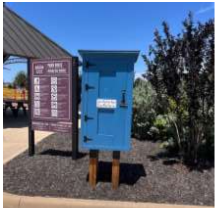
Centennial Park 1100 Scarlet Sage