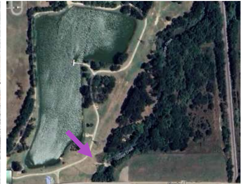
Bailey Lake Low Water Crossing