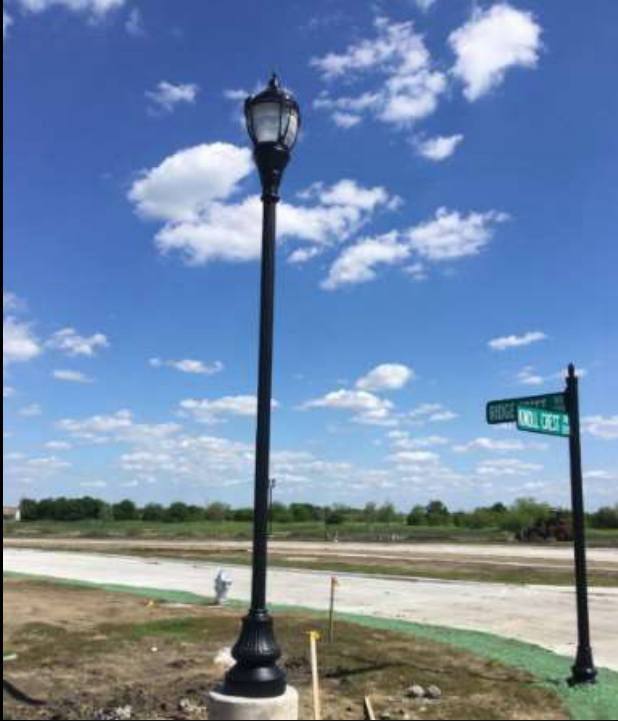
12 foot Antique Washington Light