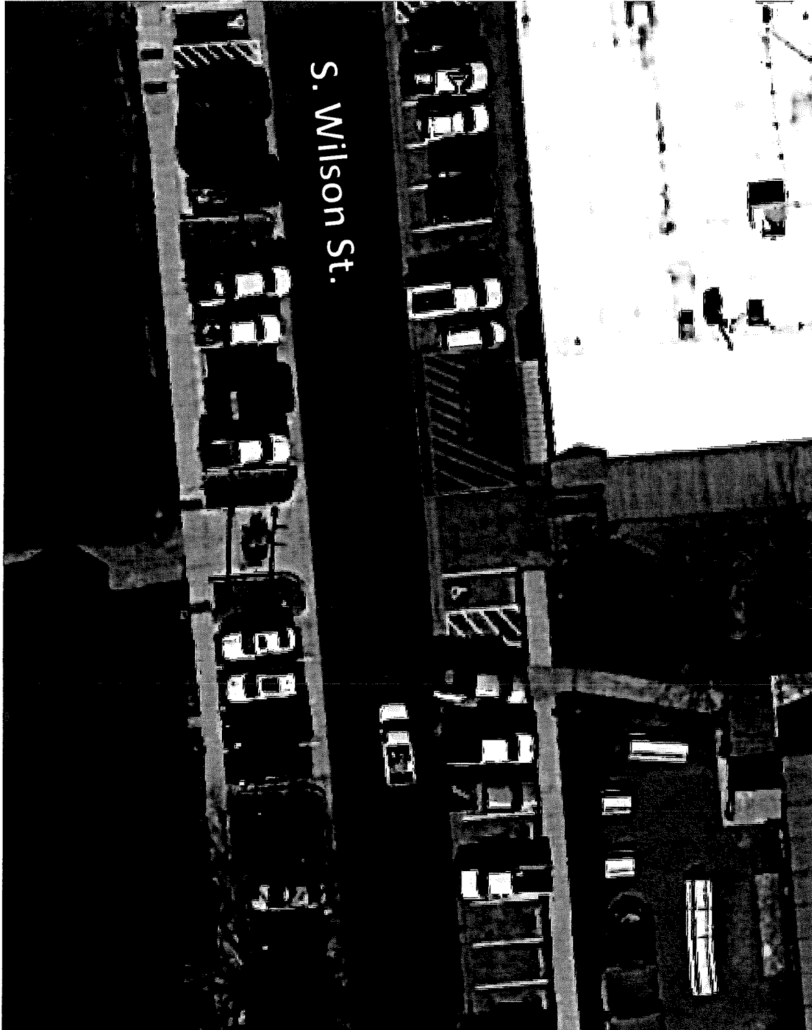
EXHIBIT A Site Plan of Affected Right-of-Way