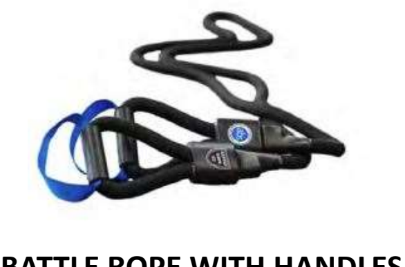
BATTLE ROPE WITH HANDLES