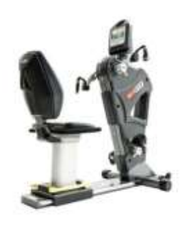
TOTAL BODY EXERCISER