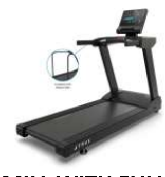
TREADMILL WITH FULL-LENTH HANDRAILS