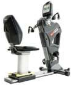
TOTAL BODY EXERCISER