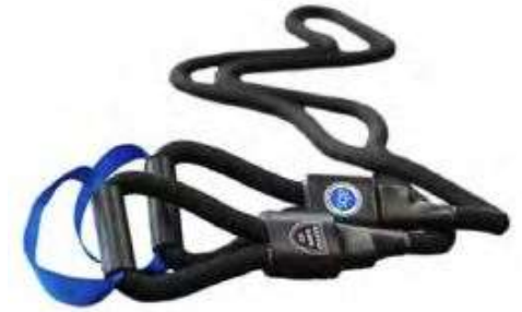
BATTLE ROPE WITH HANDLES