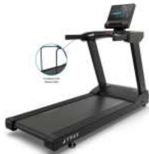
TREADMILL WITH FULL-LENGTH HANDRAILS