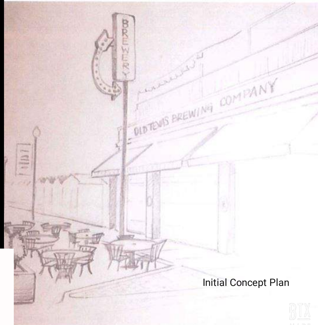
Initial Concept Plan