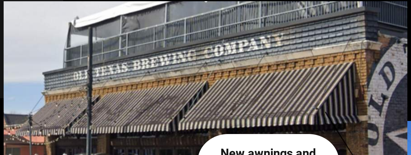
New awnings and paint to refresh sign