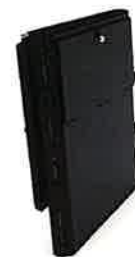
Ballot box collapses for easier transportation and logistics

Intelligent scanning restricts provisional ballots from being cast. This ensures correct vote totals and results reporting.