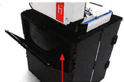
Emergency ballot access