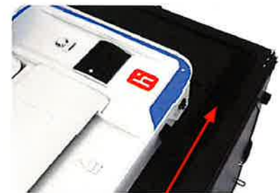
Emergency ballot collection

Easy scanning for voters and less work for poll workers.