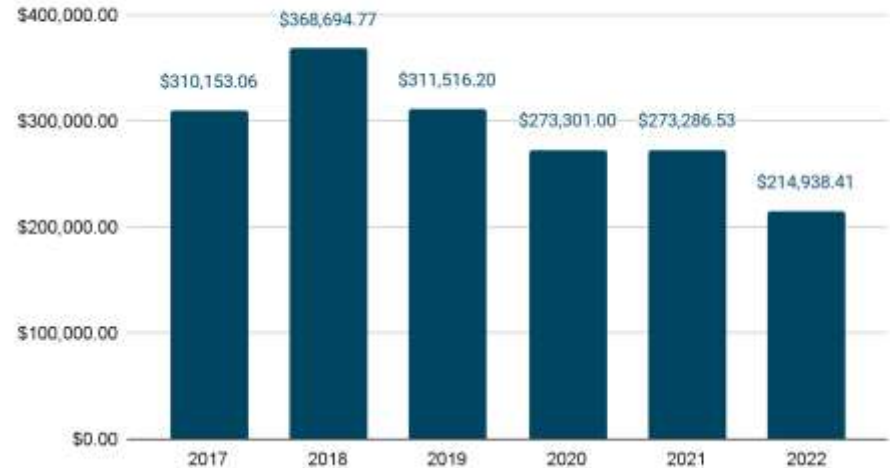
Scholarships by Academic Year (2017 - 2022)