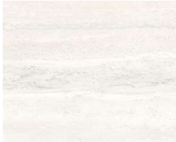
Bathroom / Breakroom Tile