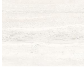
Bathroom / Breakroom Tile