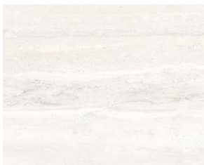
Bathroom / Breakroom Tile