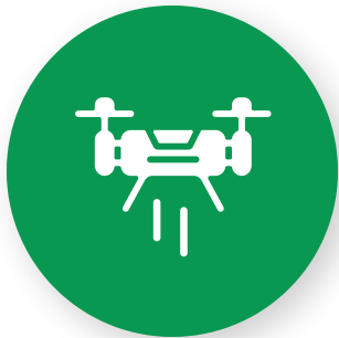
TOPOGRAPHIC SURVEY AND BOUNDARY IDENTIFICATION

Mycoskie & Associates, Inc. (MMA) was selected to provide engineering design services at a negotiated fee of $50,000