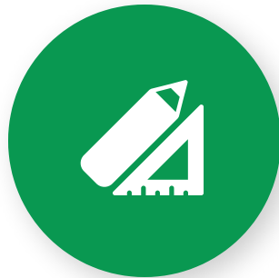
FULL DESIGN AND CONSTRUCTION ESTIMATE